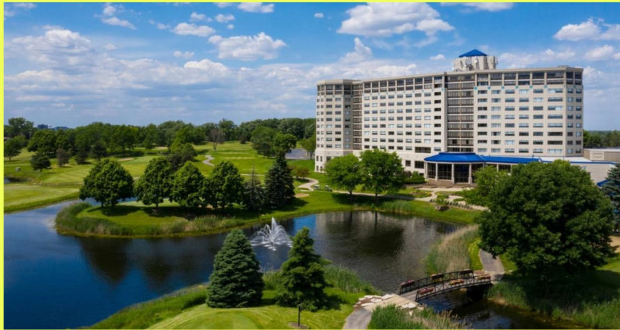
Oak Brook Hills Resort & Conference Center

APRIL 7-9 / OAK BROOK HILLS RESORT / OAK BROOK, IL